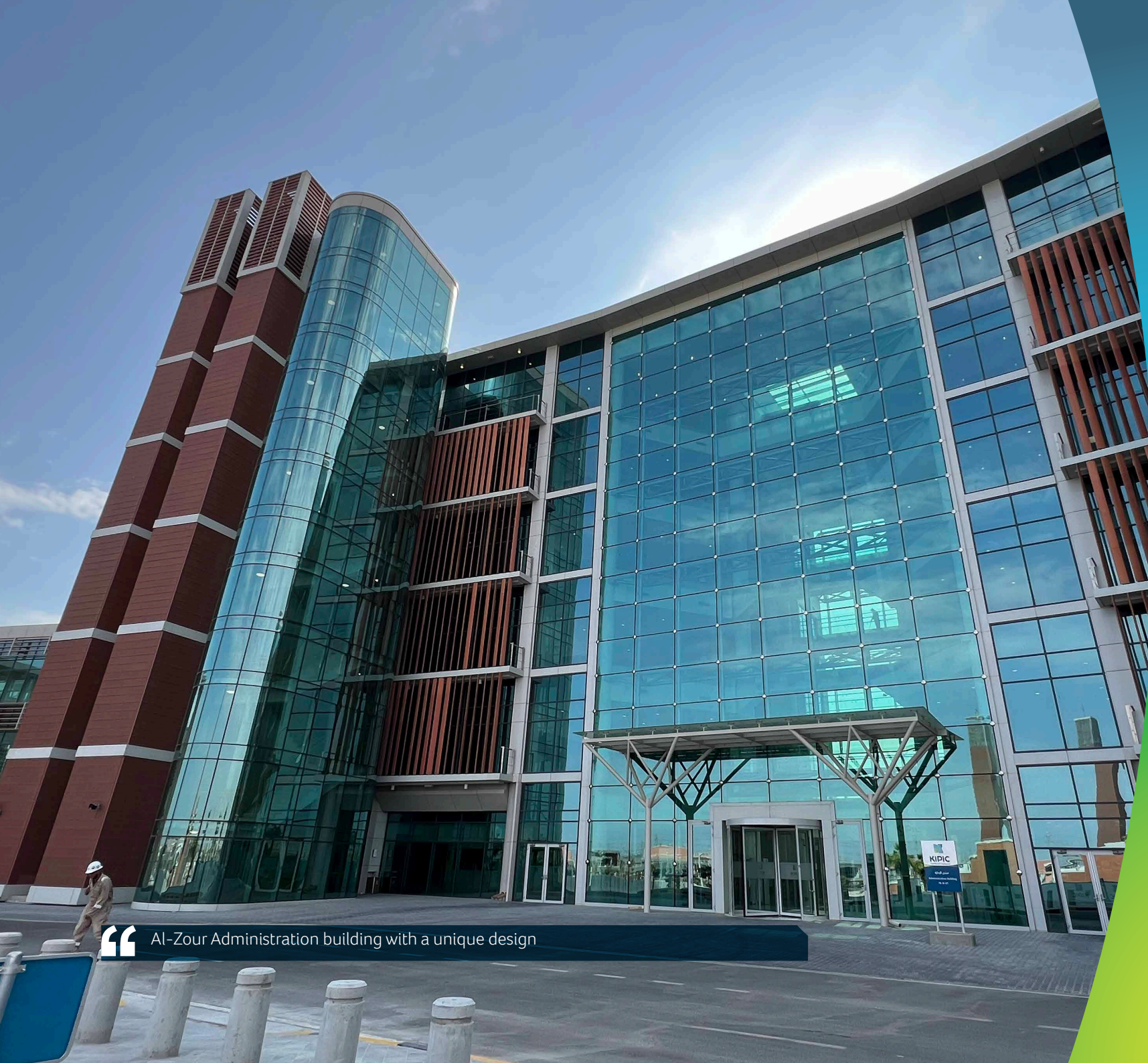
“ Al-Zour Administration building with a unique design