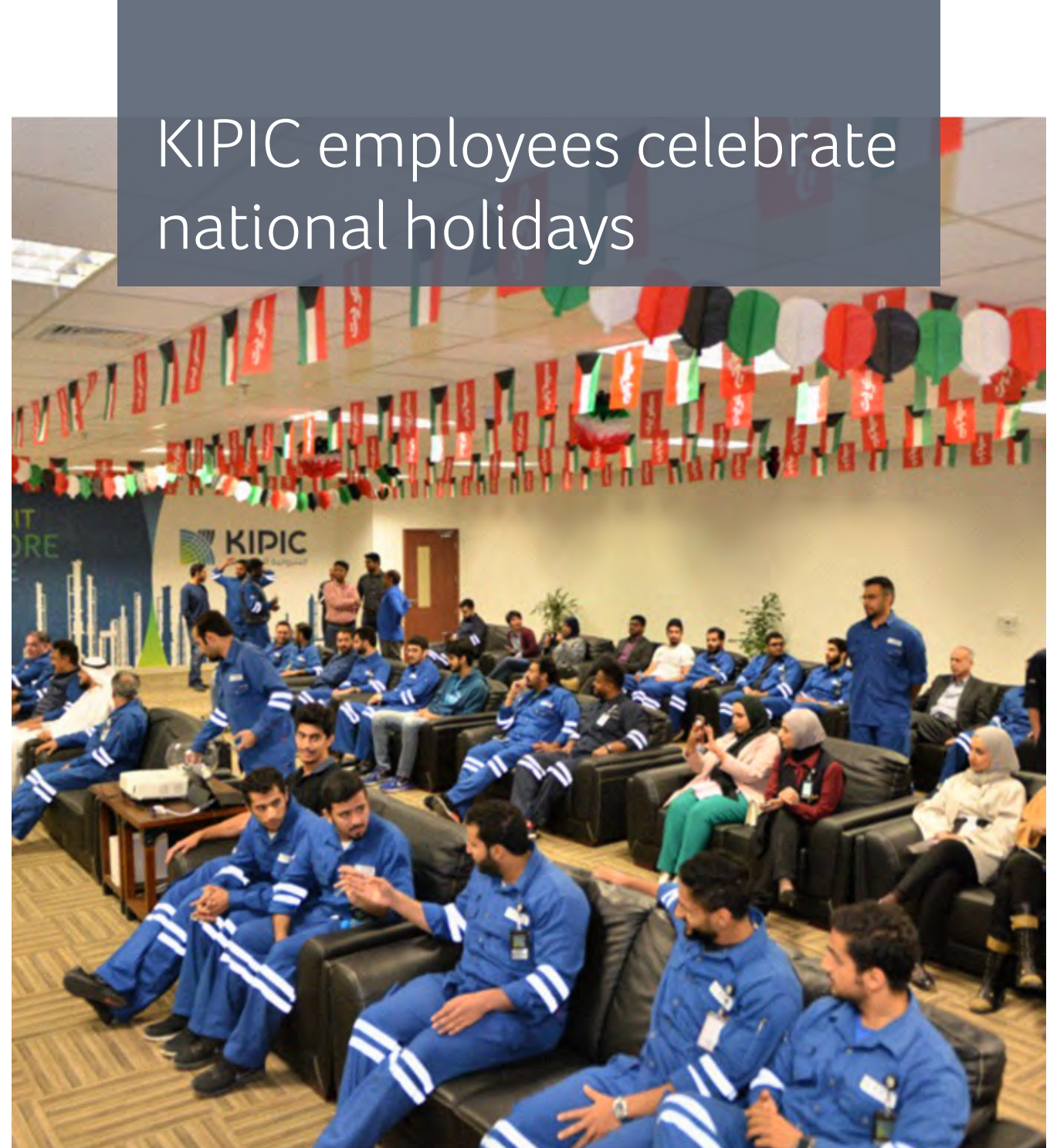
KIPIC employees celebrate national holidays