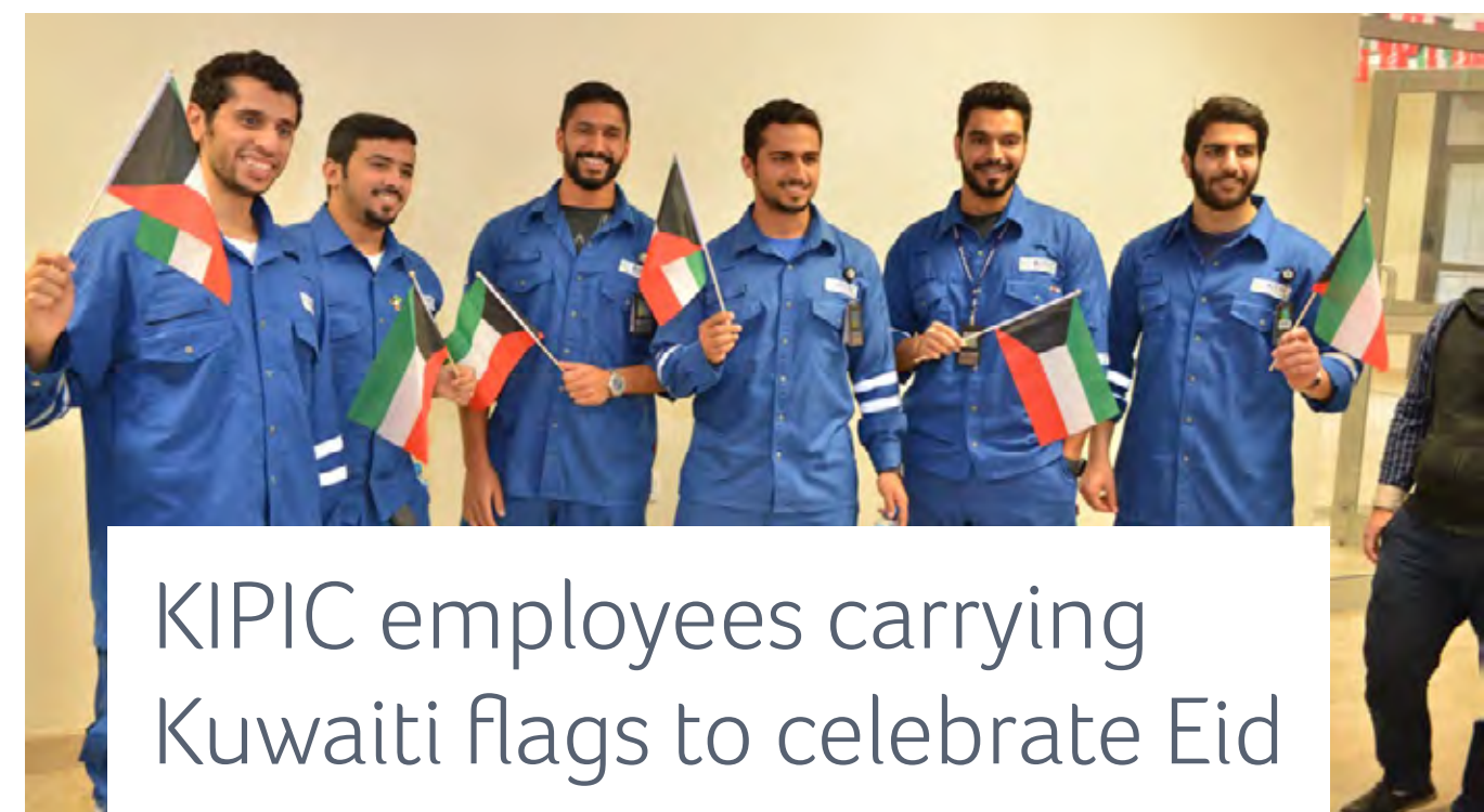
KIPIC employees carrying Kuwaiti flags to celebrate Eid