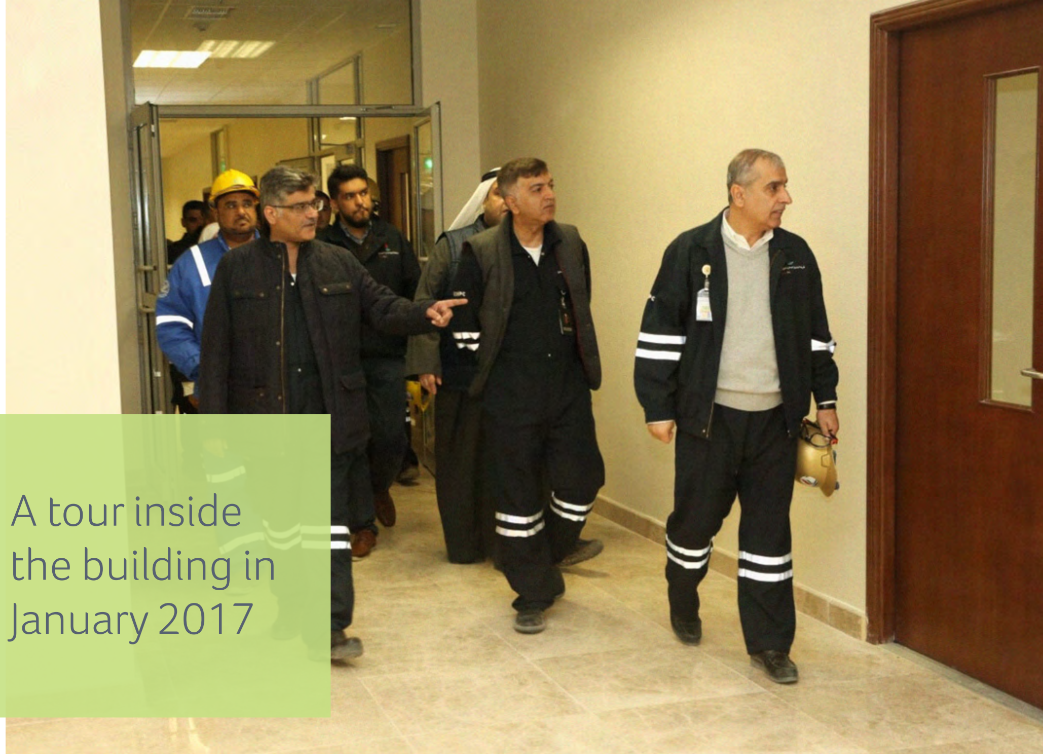
A tour inside the building in January 2017