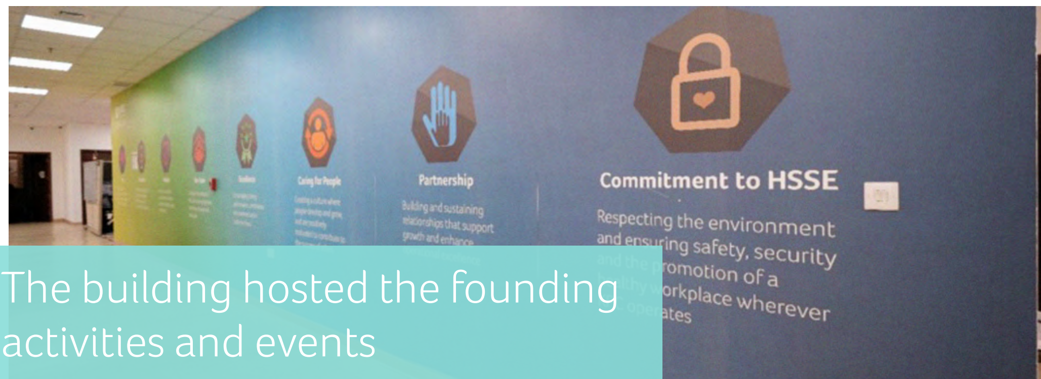
The building hosted the founding activities and events