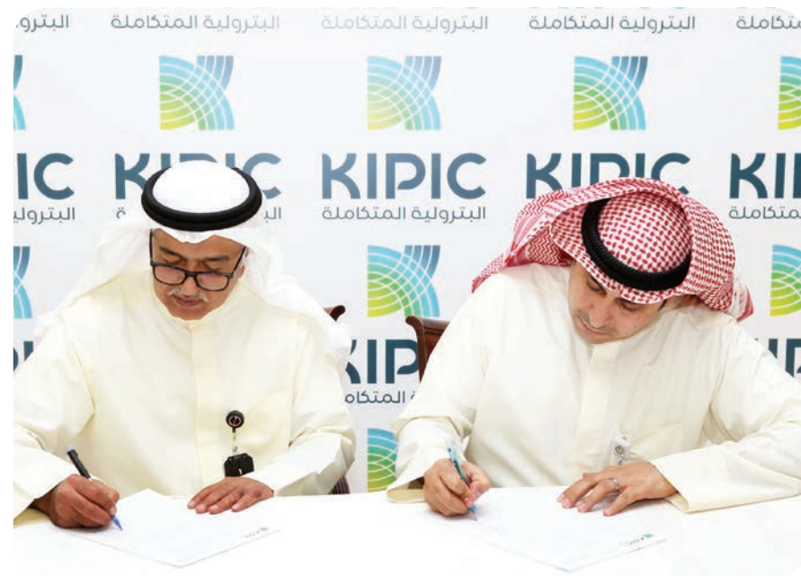
Signing of the contracts

She said that KIPIC's major goal is to achieve integration through building, operating and managing Al-Zour Refinery, LNG Import Facilities and Petrochemicals Complex. "Together, the three are part of a wider strategic and grand development project in Kuwait," she added.