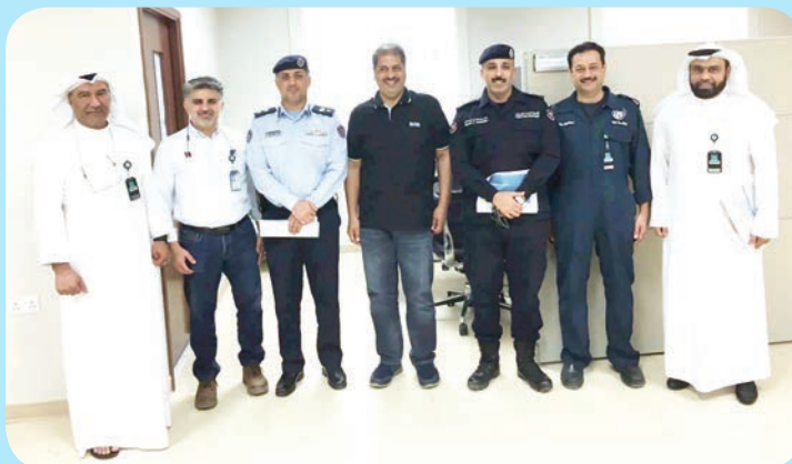
KIPIC's health, safety group with officers from fire directorate

As part of the responsibilities of Kuwait Integrated Petroleum Industries Company (KIPIC), the company's Health, Safety, Environment, Security and Fire Fighting Group held a meeting with representatives of the Kuwaiti General Directorate of Coast Guard.