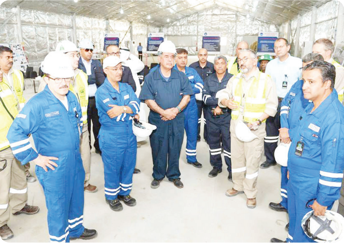
KIPIC's top officials being briefed on work progress.