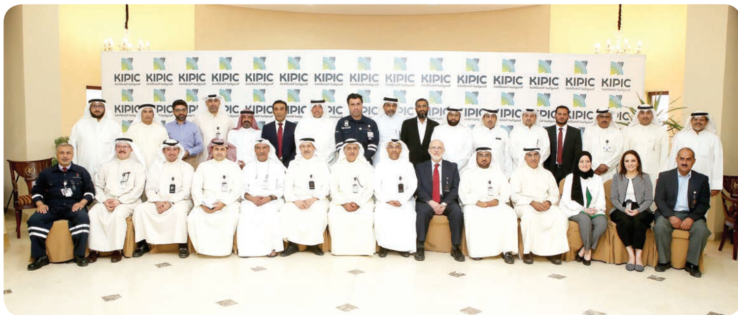
KIPIC officials managers and team leaders

Kuwait Integrated Petroleum Industries Company (KIPIC) saw its actual launch after announcing its administrative structure. A host of managers and team leaders signed their employment contracts with the company at the Hubara Club of Kuwait Oil Company (KOC).