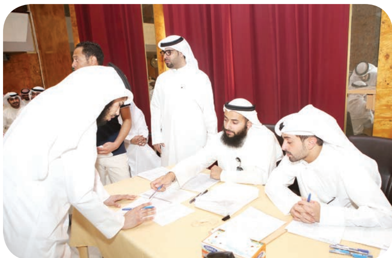
Part of the signing