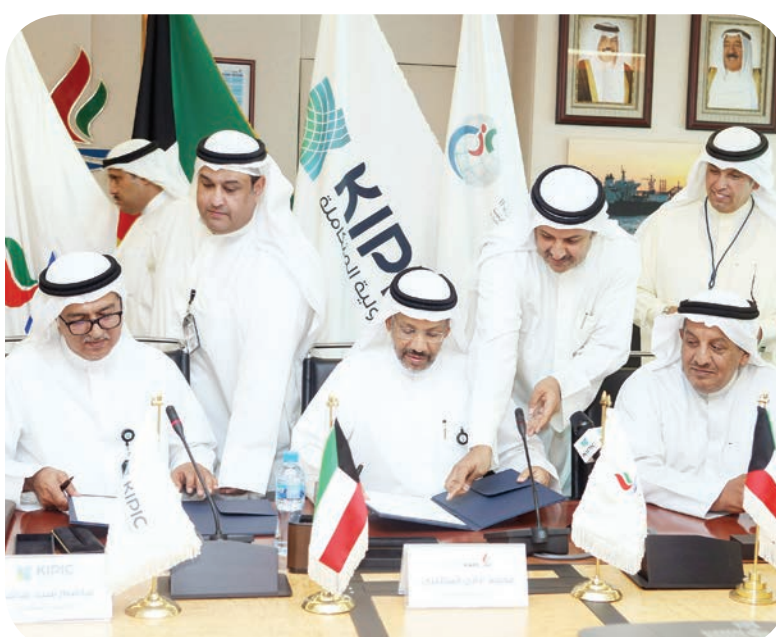
Part of the signing