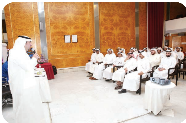
Training courses for the operators