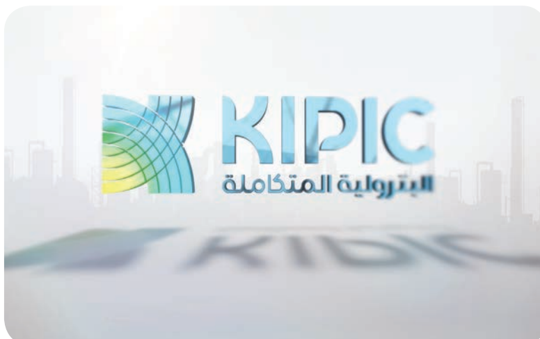
KIPIC's formal logo