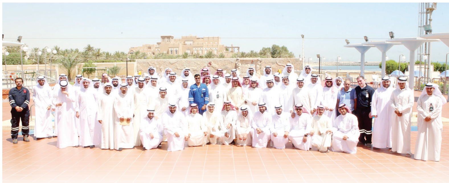
The first batch of the operators

Al-Alyan: cooperation agreement with PAAET attracts operators