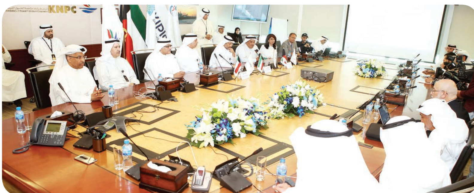
Preparing for signing

Procedures, legal grounds achieved in record time