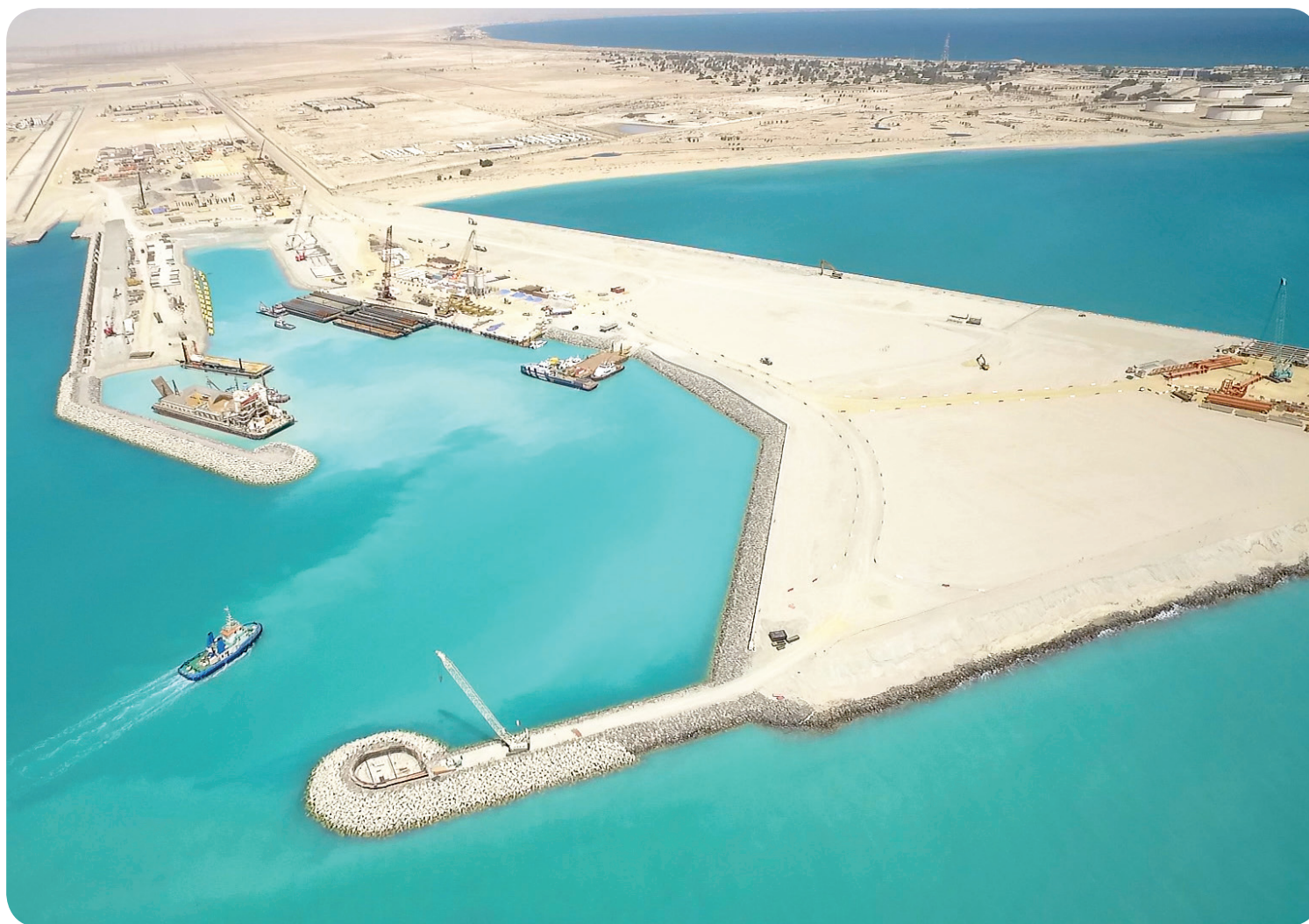
One of KIPIC's projects

The actual take-off of Kuwait Integrated Petroleum Industries Company (KIPIC) took place in April 2017, as one of the largest subsidiaries of the Kuwait Petroleum Corporation.