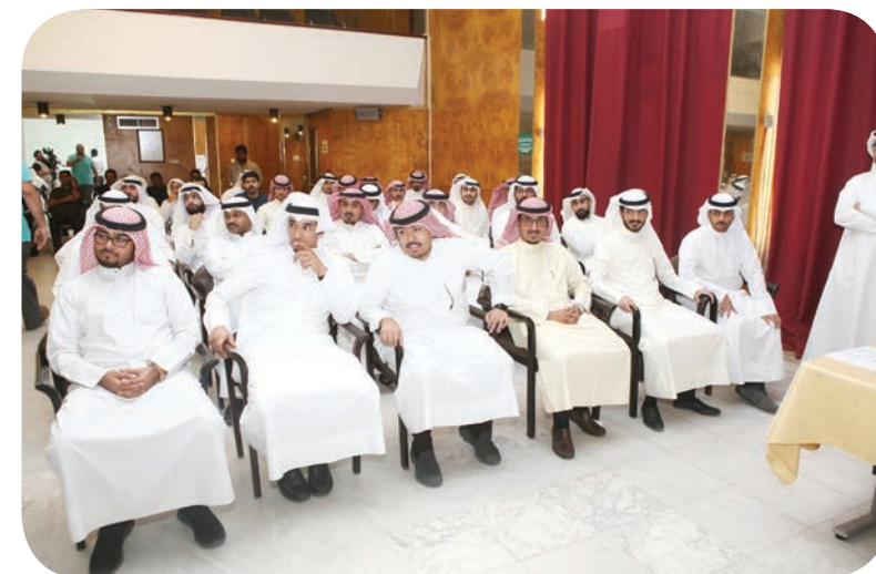
A group of new operators