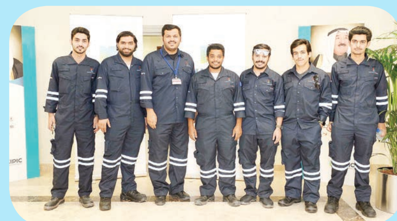
A group of KIPIC employees