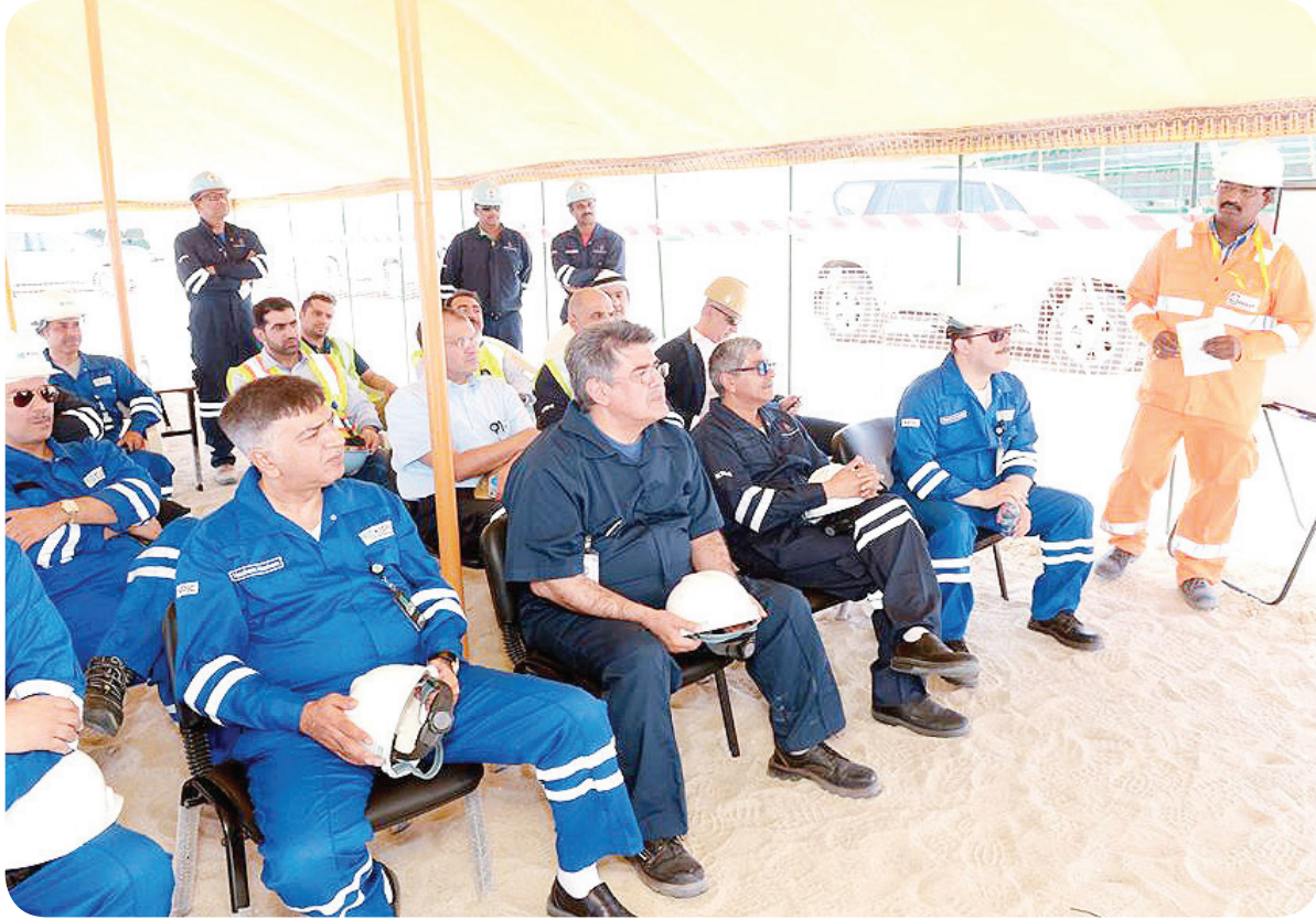
Work proceeding by leaps and bounds