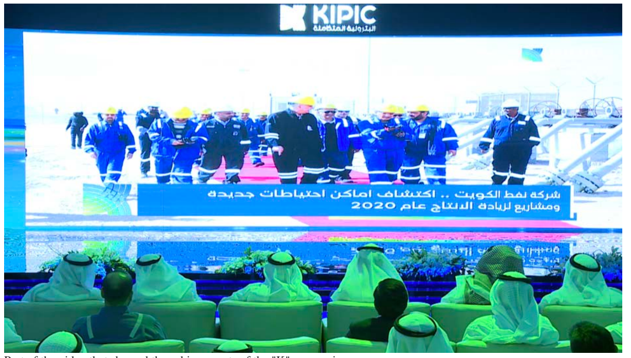
Part of the video that showed the achievements of the "K" companies