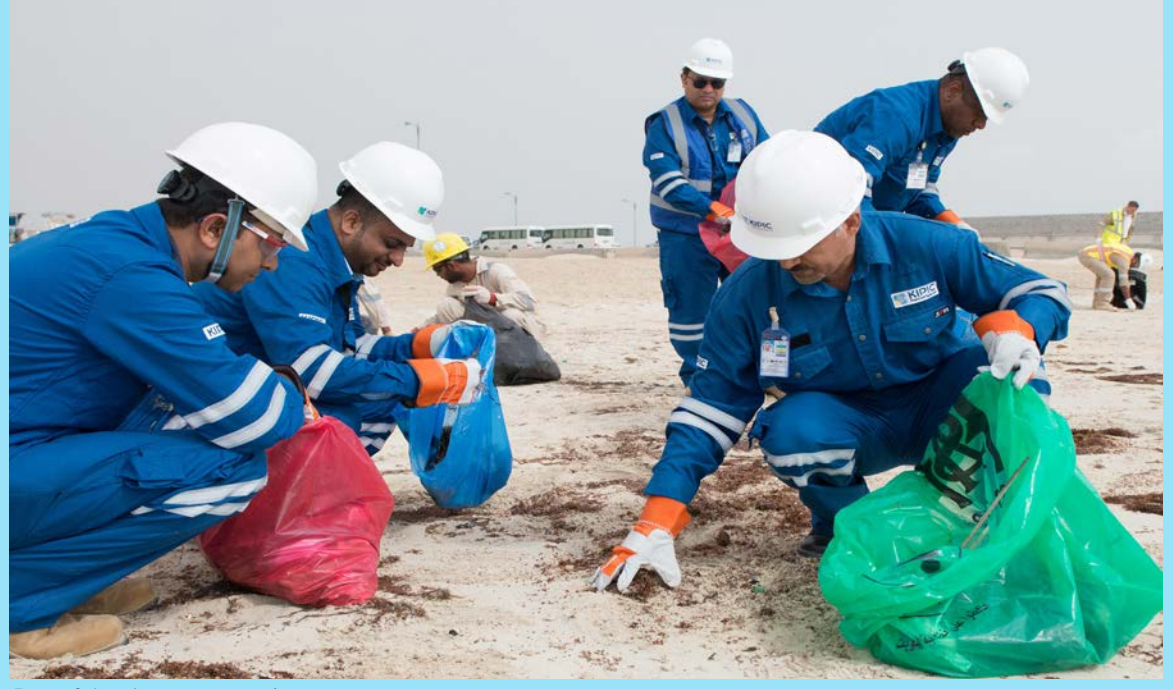
Part of the clean-up campaign

KIPIC organized a clean-up campaign at Al-Khiran Beach in accordance with its Corporate Social Responsibility (CSR) towards Kuwait's environment.