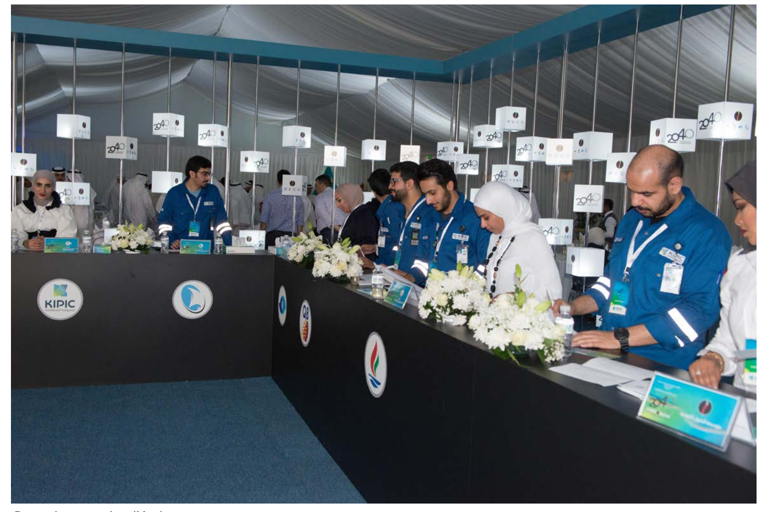
Preparations to receive oil leaders