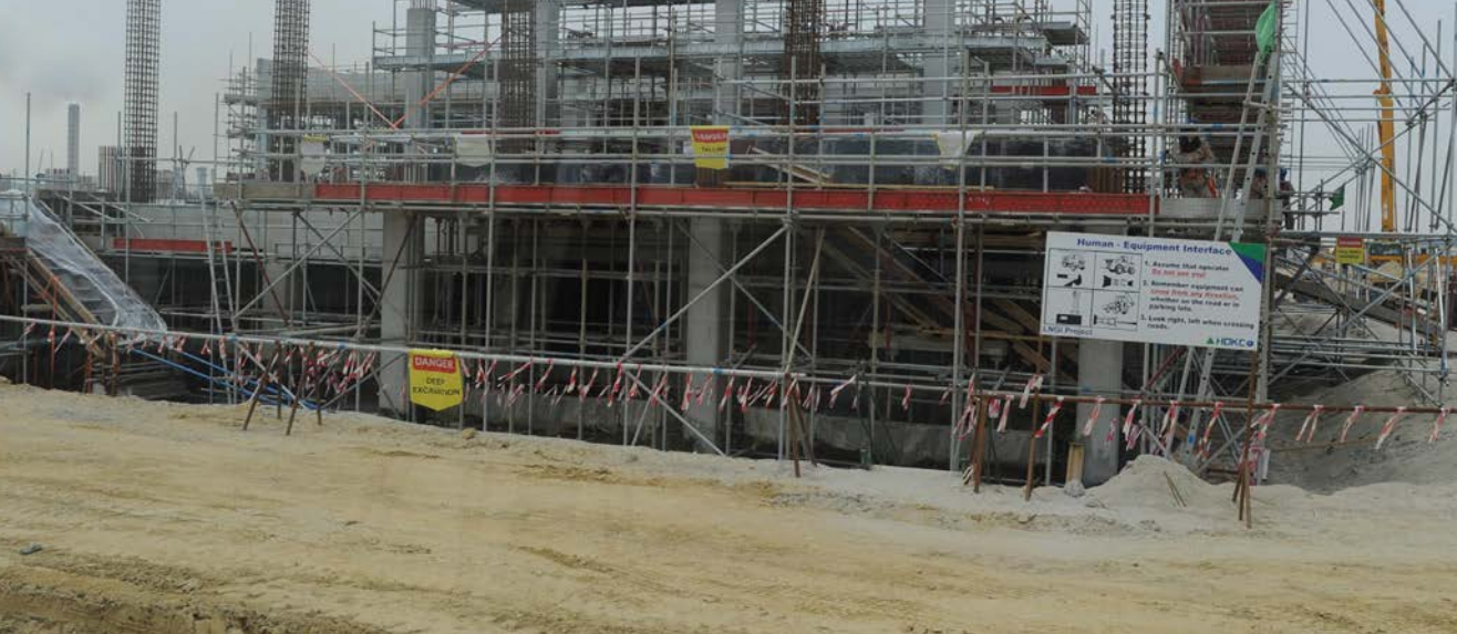
Briefing oil leaders on achievements at KIPIC projects