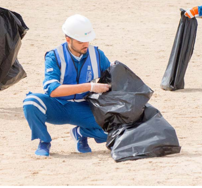
Campaign coincided with Earth Day