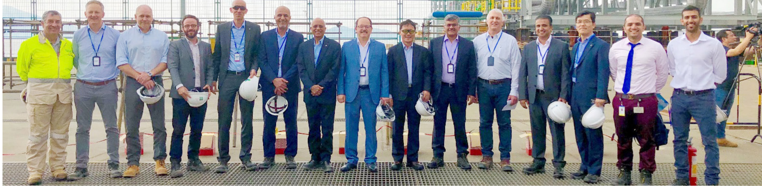
Chinese officials attending the observance