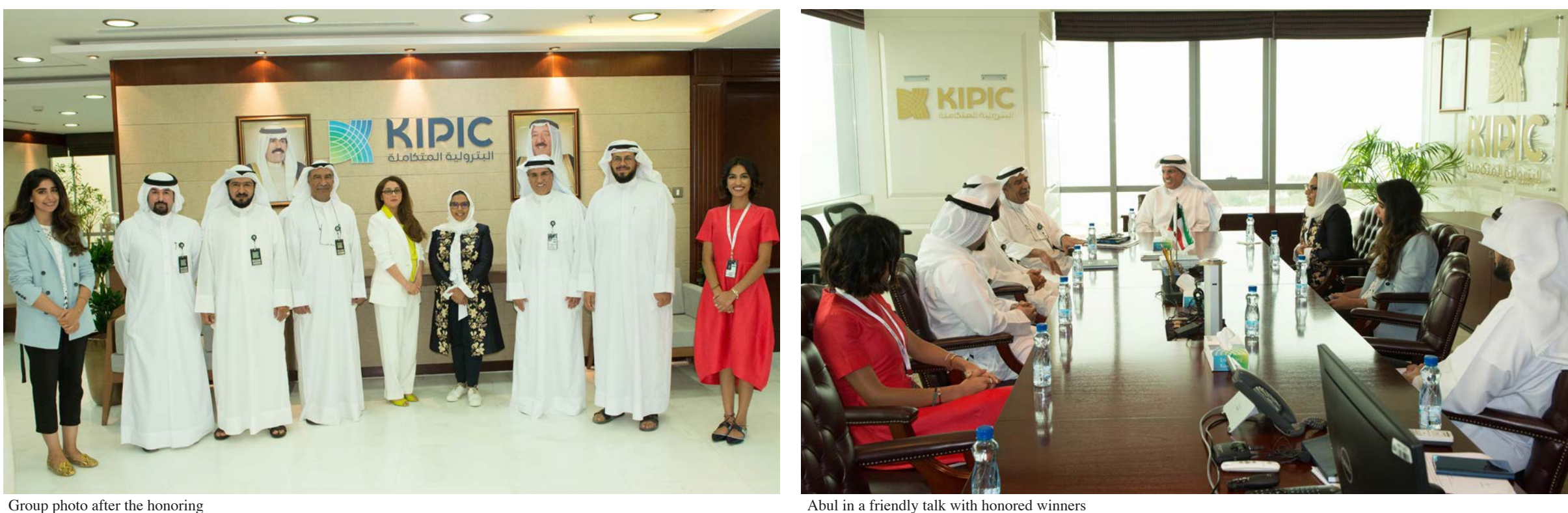
Group photo after the honoring

KIPIC hosted a ceremony in honor of the winners in the first Health, Safety, Security and Environment (HSSE) CEO Award 20172018- for the best initiatives and programs.