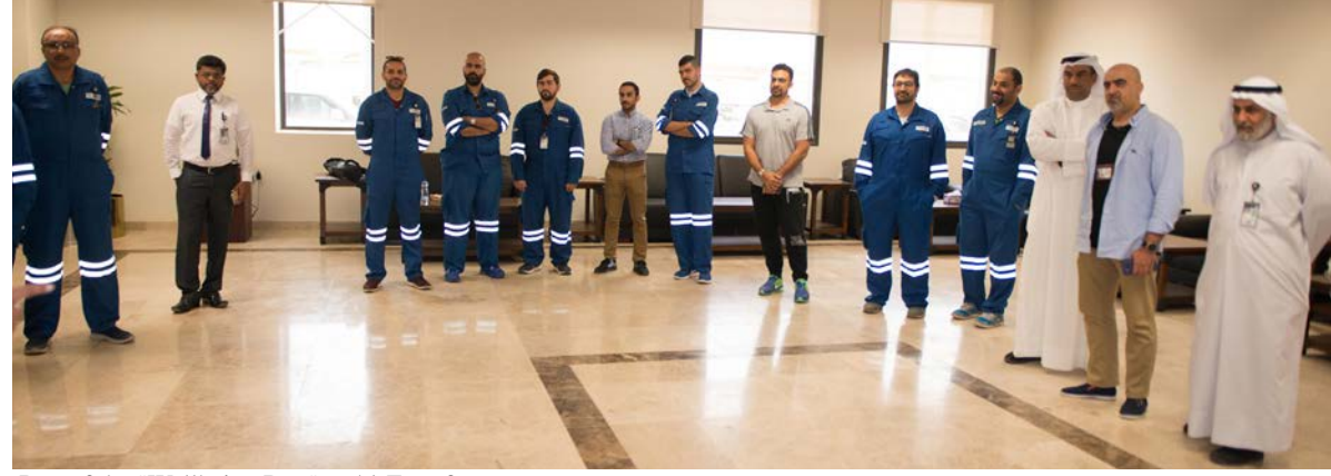
Part of the "Wellbeing Day" at Al-Zour 2

KIPIC organized a health activity for the staff at Al-Zour 1 and Al-Zour 2 as