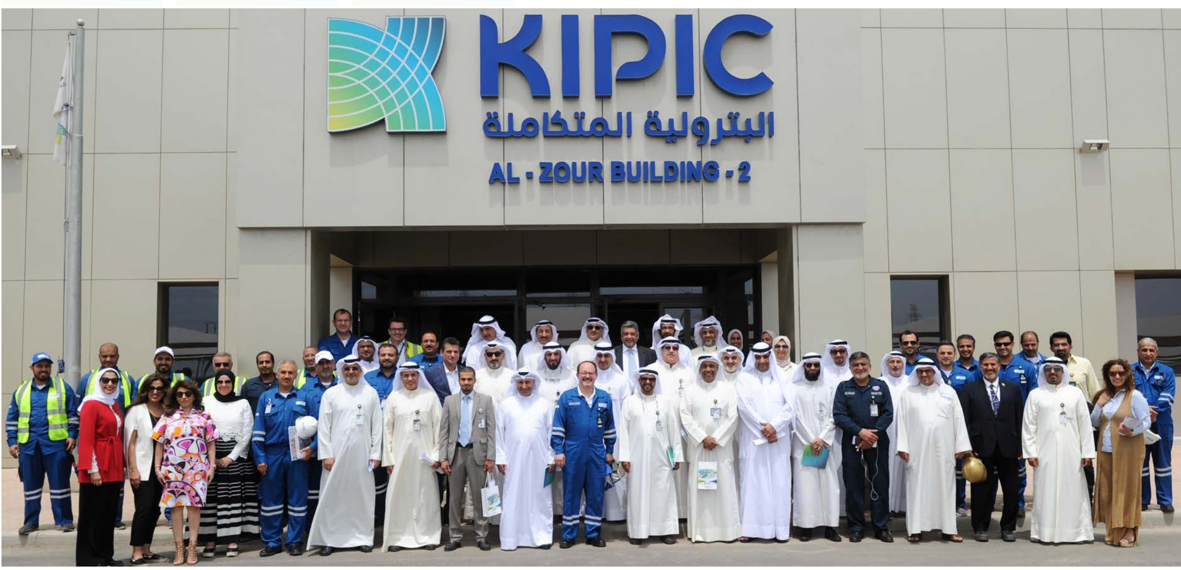
Group photo following the field visit