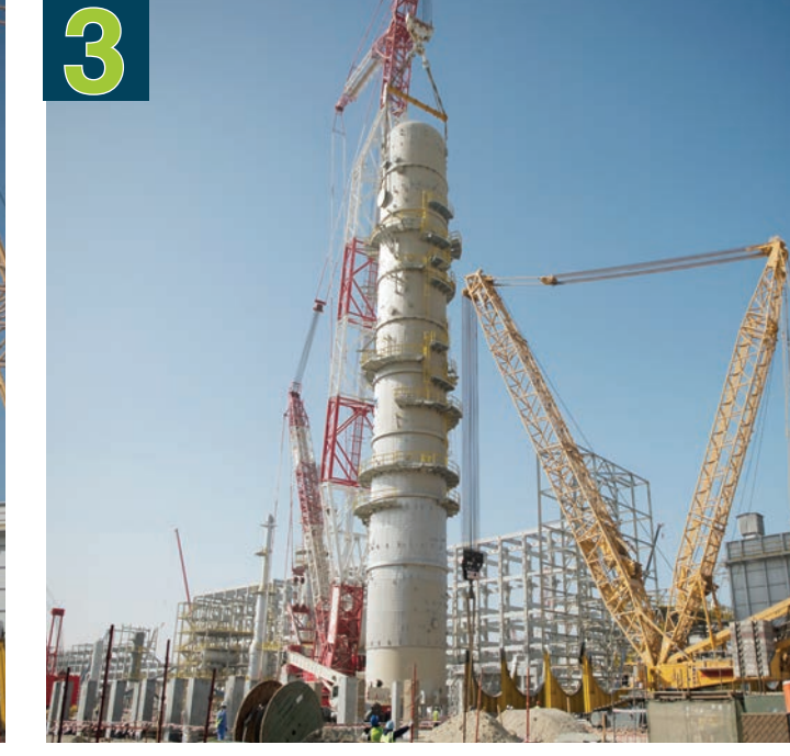
Phases of installing crude distillation column