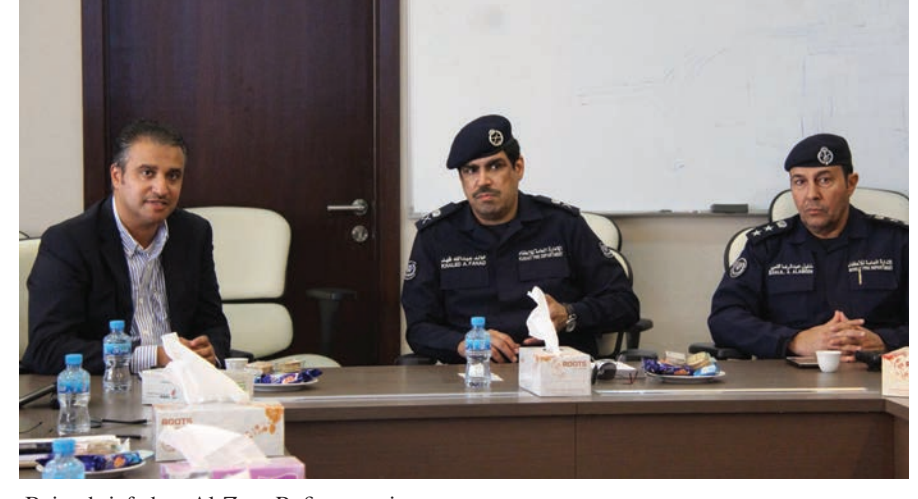
Being briefed on Al-Zour Refiney project

Both parties inspected some of the main buildings in the refinery.