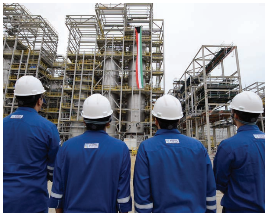
KIPIC's employees hoisting Kuwait's flag over Al-Zour Refinery