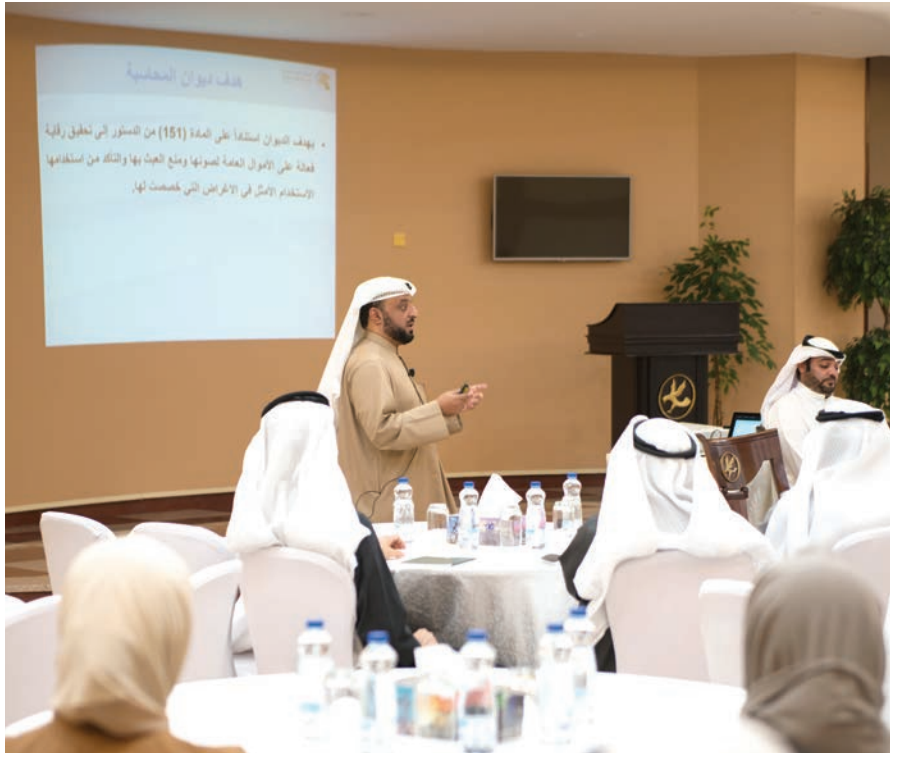
SAB official illustrating auditing mechanism