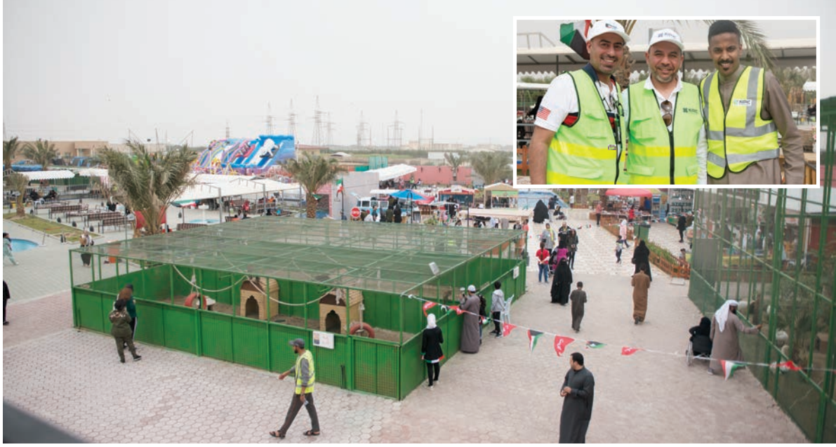
Bab Dukkala Reserve; (inset) Three KIPIC's employees

KIPIC organized the first trip to Bab Dukkala Reserve for employees and their families. A warm family atmosphere dominated the scene and everyone enjoyed the trip.