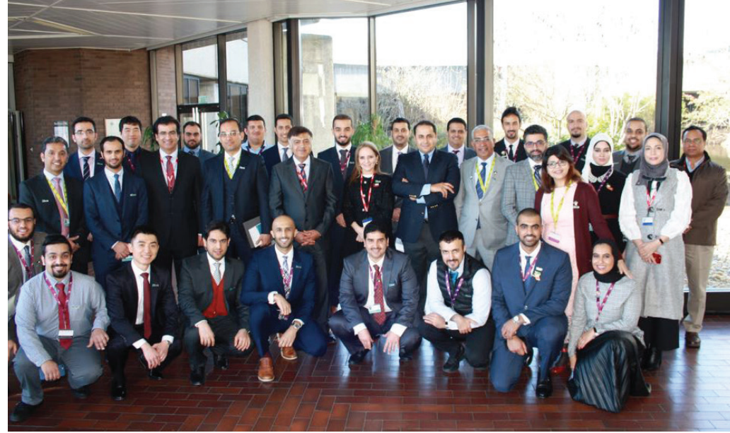
Group photo with KIPIC's engineers