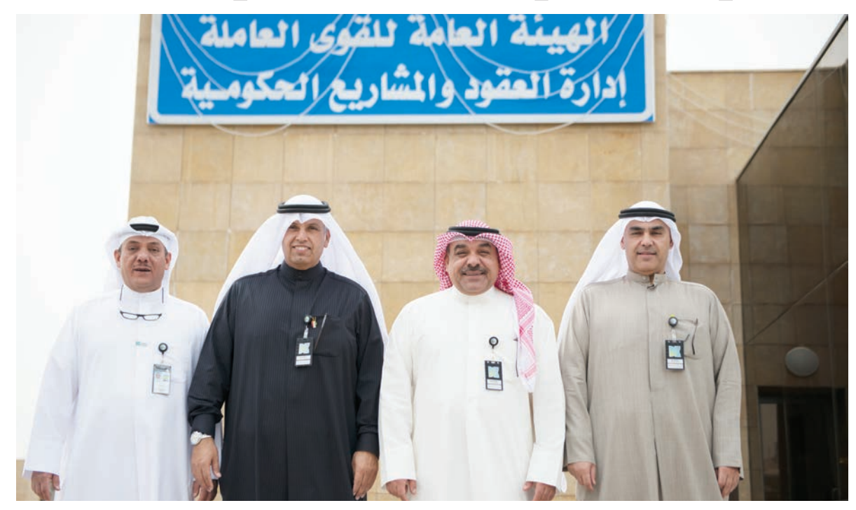
Local Relations Team after the honoring ceremony

KIPIC recently honored the Major Government Contracts Department at the Public Authority for Manpower (PAM) for working in line with the company's keenness to maintain close cooperation and coordination with all official bodies. The authority exerts tremendous efforts to attract skilled and experienced technical labor needed by contractors implementing KIPIC's mega projects, said Local Relations