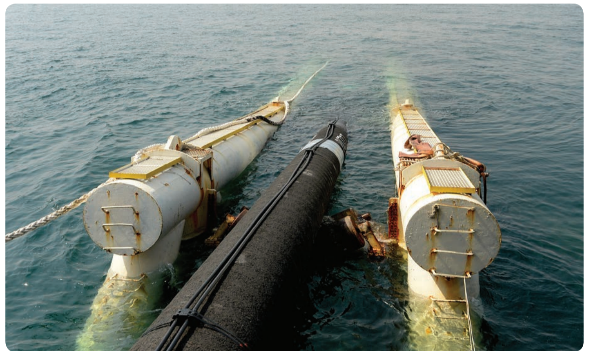
Placing the pipes in the water