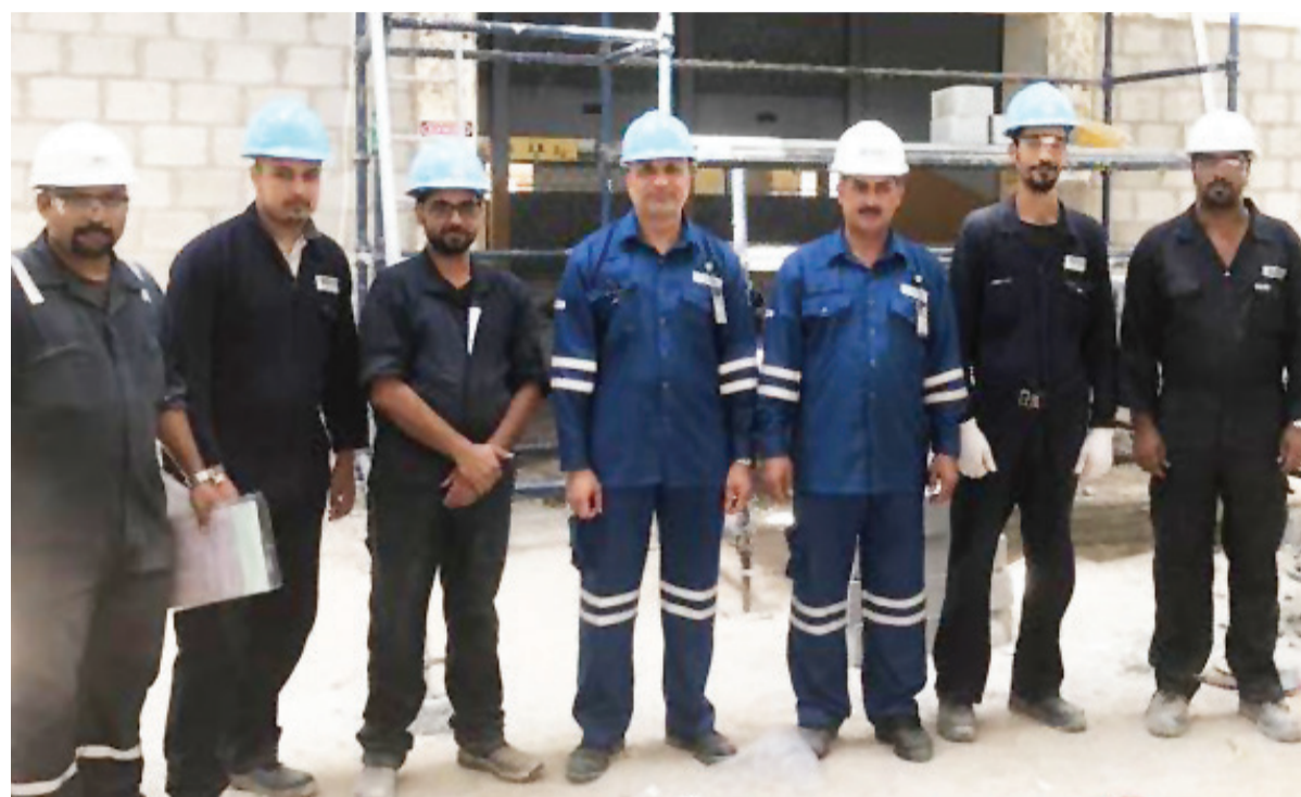
A part of the visit

of the inspection program applied by all officials according to a decided timetable throughout the year, stressing that all employees should be well aware of all safety measures, and their due roles in case of emergency.