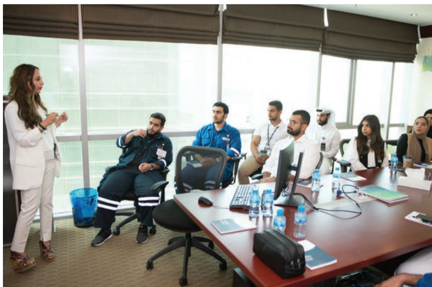
Answering all the questions