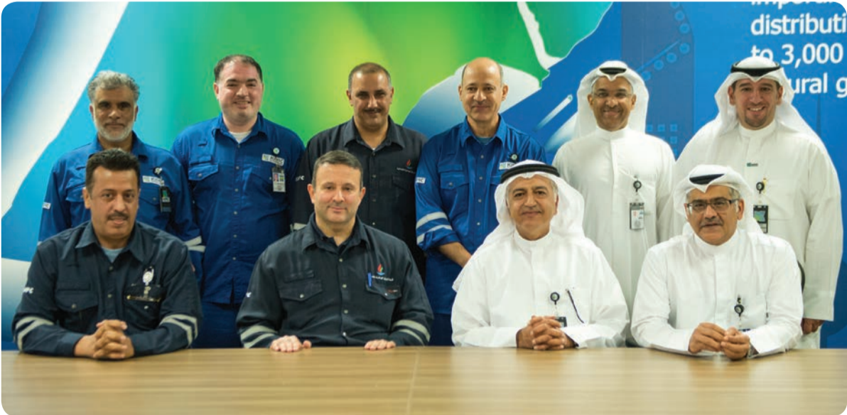
Team leaders after signing the contracts

Hashim: These new employees will be a significant addition Al-Awadhi: This batch includes experts who will undergo training courses Al-Jeemaz: They will be fully dedicated in working at Al-Zour Refinery