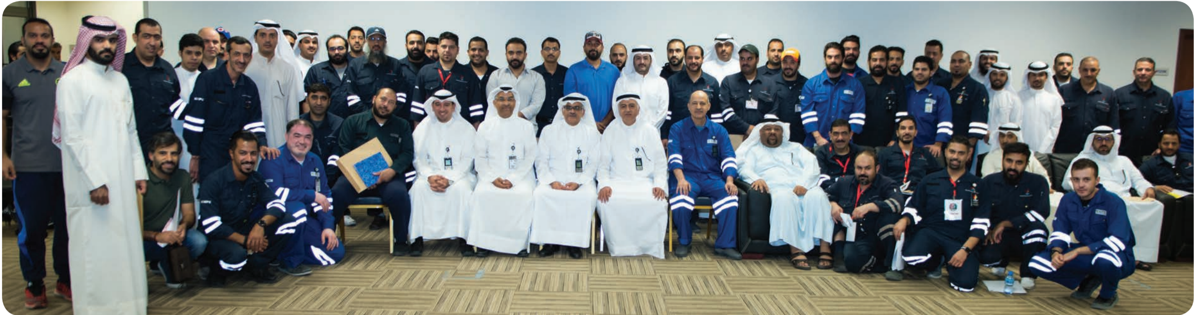
The new employees