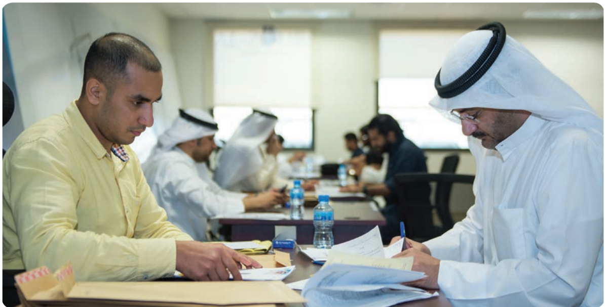
A large number chose to transfer to KIPIC