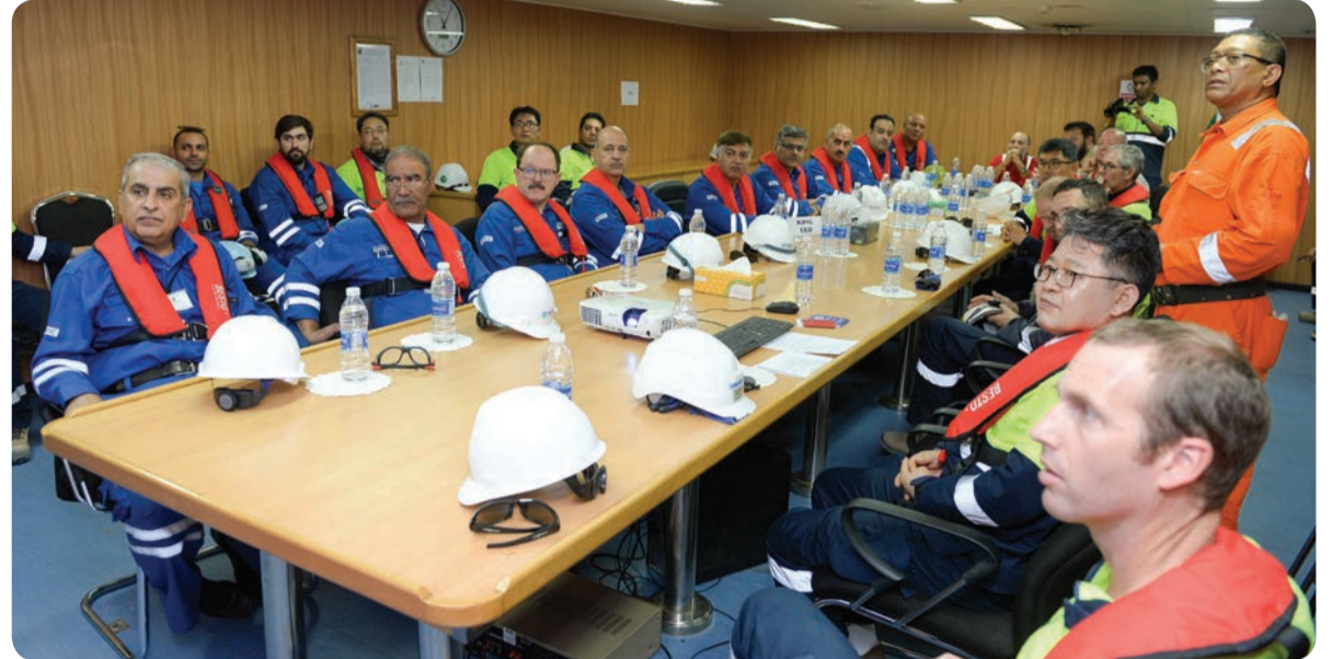
A part of the meeting