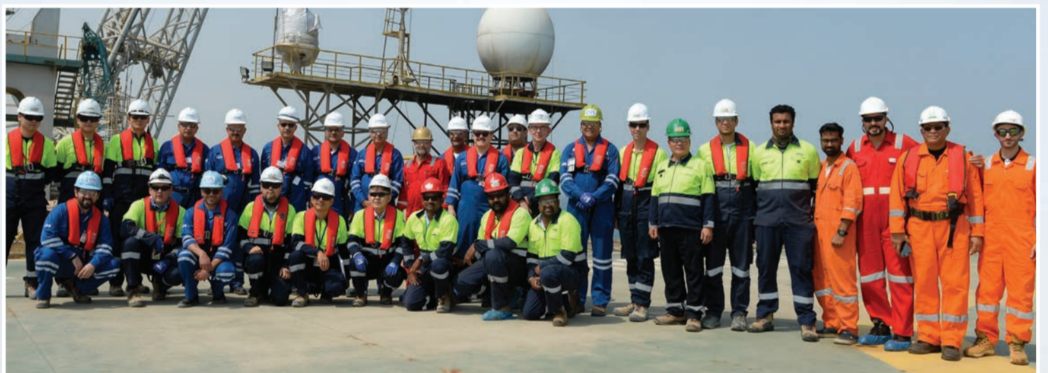
KIPIC's management during the visit