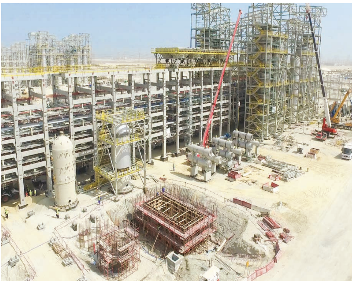
Achievements in record time

The company aims to diversify the sources of KPC's income through constructive