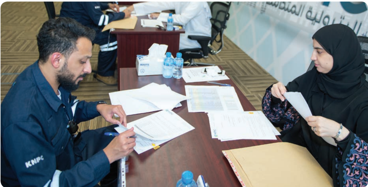
Answering all the questions related to transferring