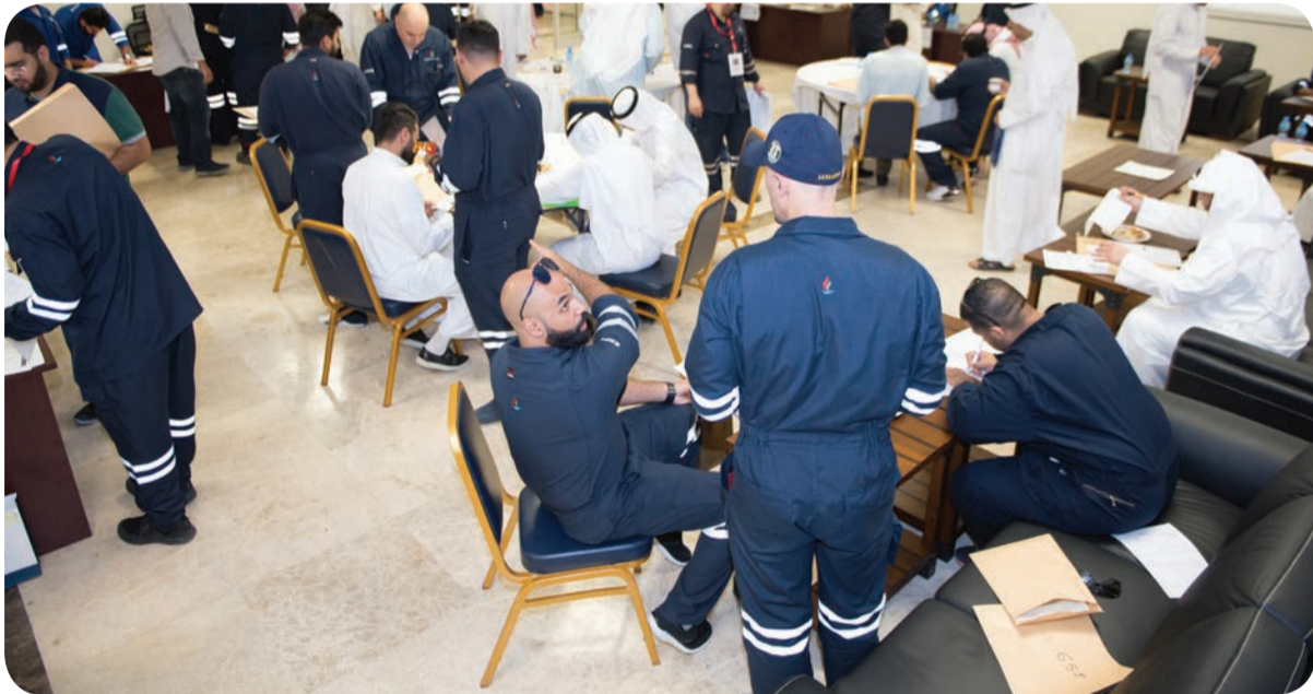
The procedures of transferring were easy

Al-Ajmi: We will follow up engineering studies and begin preparations for various stages of operation Al-Husseini: We hope to help young people develop themselves Al-Hajri: We are enthusiastic in contributing to the establishment of Al-Zour Refinery