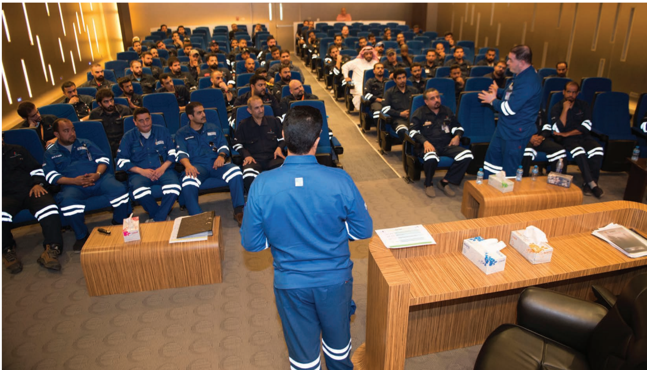
KIPIC's new employees

The Al-Zour Refinery Operations Group has organized a meeting for KIPIC's new employees, in collaboration with Mina Abdullah's Operations Department and the Training and Career Development Department at Kuwait National Petroleum Company (KNPC).